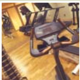
Relax and Unwind