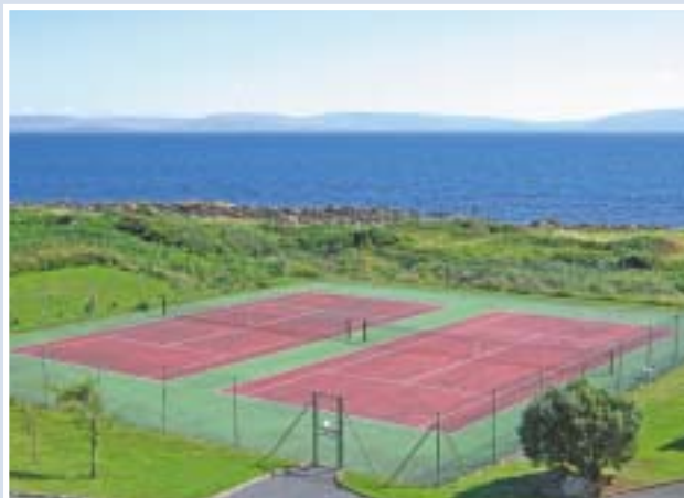
A million miles from the pressures of every day living yet only ten minutes from the colour and excitement of Galway City.