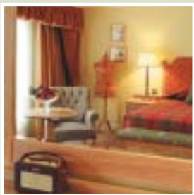
Style and Elegance