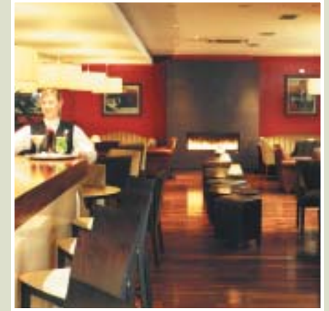
A fusion of classic and contemporary styles in the heart of the capital city