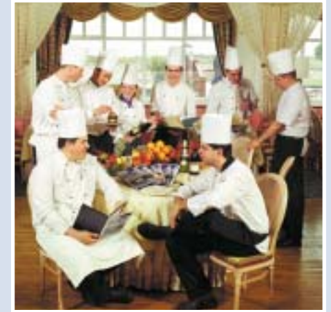
Fine food cooked by our team of chefs and served with a smile