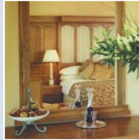
Comfortable accommodation in a spectacular location