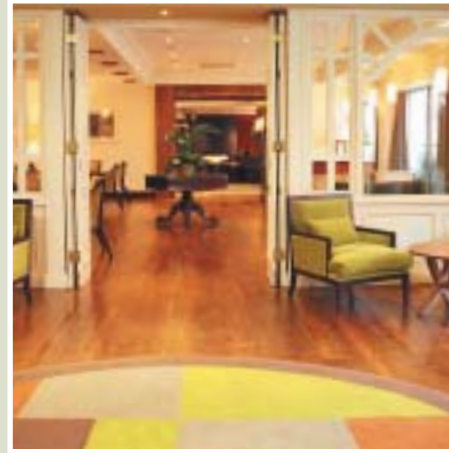
Relax and dine in style with innovative international cuisine